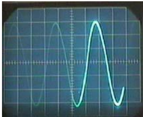
Waveform at 950 watt load.

These traces show the phase shift within the capacitor/inductance combination. The inductance is from the motor windings. Traces were made by feeding a 10 v p-p 60 hertz voltage through a 47 ohm resistance to the capacitor/inductance combination. The top trace in the left picture is the input voltage to the resistor while the bottom trace is across the capacitor/inductance.