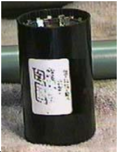
Typical Running Capacitors...GOOD! .....Starting cap...Bad!

In the following example, I used a 1 horsepower motor from a Sears water pump that I bought at a junk yard for $10.00. This motor was capable of operating off of 115 or 230 volts at 13 or 7 amperes respectively.