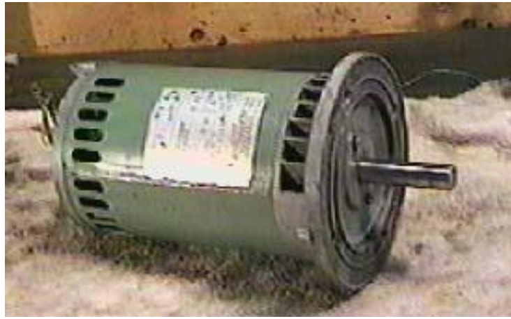
Typical waterpump motor

Motor: A. O. Smith 1 Horsepower : 115 / 230 VAC : 13 / 7 AMPS : 3450 RPM