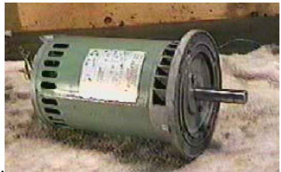
Typical electric squirrel cage motors

Besides being numerous and cheap, they will generate AC voltage of the purest sinewave. They use no brushes and do not produce any RFI.(Radio Frequency Interference) A motor converted to an induction generator will power flouresent and incandesant lights, televisions, vcr's, stereo sets, electric drills, small power saws and other items.